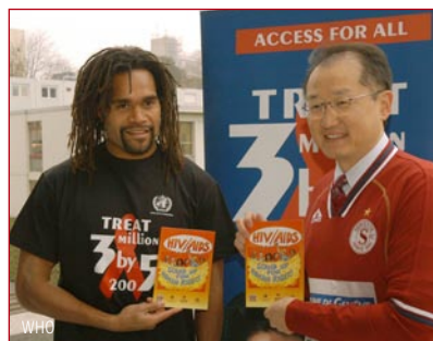
Footballer Christian Karembeu and WHO Director of HIV/AIDS Dr Jim Yong Kim at the cartoon launch

To mark World Human Rights Day (December 10), WHO and FIFA (the Fédération Internationale de Football Association) joined forces to address stigma and discrimination in the context of HIV/AIDS. A cartoon booklet called "HIV/AIDS – Stand Up for Human Rights" has been distributed via five of FIFA's national football associations: in Botswana, Ghana, South Africa, Uganda and Zambia. Events are also being organized in these countries to promote education and awareness-raising among young people.