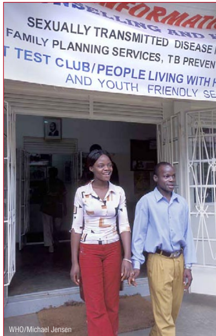
In Uganda, testing and counselling services have been scaled up

Stigma has long been a barrier to individuals seeking testing and counselling. Experience from Botswana and other countries demonstrate, however, that wide-scale treatment availability coupled with a routine offer of testing and counselling is able to shift perceptions and break down the deeply imbedded fears that have long characterized the HIV/AIDS epidemic.