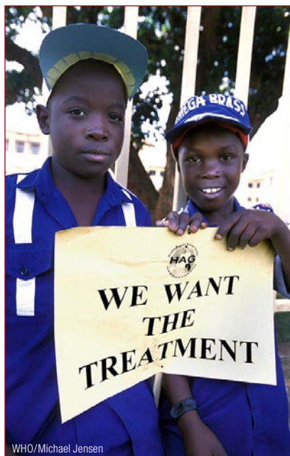
Affordable suitable AIDS medicines for children are beyond the reach of many families

Further details including presentations the agenda and meeting report are available at: www.who.int/3by5/paediatric/en