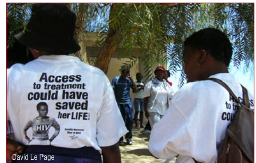
Treatment literacy trainers from the Treatment Access campaign (TAC) mobilize communities in Grahamstown in South Africa's Eastern Cape

Through WHO's 'Preparing for Treatment Programme', the contract was awarded to the Tides Foundation-managed Collaborative Fund. The fund was created in 2003 to channel funds for community-based education. "Making this happen has been a dream for WHO and underlines the recognition that the future of health belongs as much in the hands of those affected as those who care for them. Treatment preparedness is key to "3 by 5" and a first instalment towards reaching universal access for all who need it," said Dr Jim Yong Kim, Director of WHO's HIV/AIDS department.