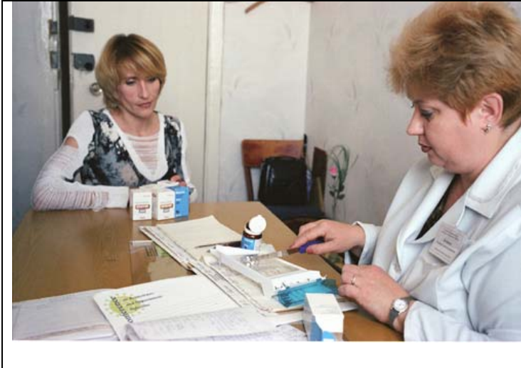
Odessa AIDS Clinic, Ukraine, 2004

WHO HIV/AIDS department has a photo library of more than 1400 photos developed and produced by WHO and its consultants in various regions and countries. The photos can be freely used for non-commercial, educational and information purposes, crediting the authors.