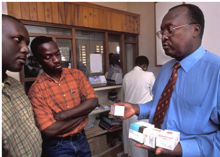
TASO Clinic in Uganda, 2004

Under "3 by 5" global target, fixed dose combination drugs are becoming more and more available in developing countries. FDCs offer ease of distribution and storage and likelihood of greater success in AIDS treatment.