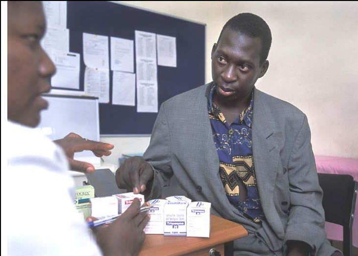
TASO Clinic in Uganda, 2004