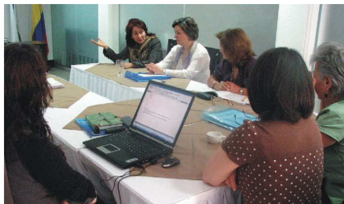
Workshop, Colombia, Disseminating Sound Choices

The Asociación Colombiana de la Salud - ASSALUD (Colombian Health Association) has committed to disseminating the Alliance biennial report "Sound Choices" in Colombia. Discussions of the report took place as part of the preparatory work on the Alliance-funded project to enhance policy-maker capacity to use evidence. In addition the Colombian Health Systems and Policy Network has presented the report to academicians, policy makers, health services providers and civil society organizations in the cities of Medellin, Cali and Manizales. Spanish language dissemination material has been prepared in a Power Point format for each chapter - please contact ASSALUD (see below) if you wish to use this. ■