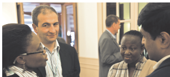
Participants from the Stock Taking Meeting, Nyon, May 2008

It is four years since the last major international meeting on health research, the Mexico Ministerial Summit, and world leaders in health research are now preparing to meet again in Bamako, Mali 17-20 th November.