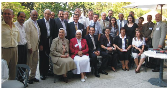
Workshop participants, Beirut, July 2008

A regional consensus meeting was held in Beirut on July 3rd and 4th 2008 to validate and rank research priorities related to health financing, human resources for health and the role of the non-state sector. The objectives of this workshop were to: (1) validate the common list of research priorities related to health financing, human resources for health and the role of the non-state sector that emerged from the nine selected countries within the region; (2) identify the most important research priorities on the 3 themes in the Middle East and North Africa (MENA) region; and (3) reach a consensus among researchers, policy makers and other stakeholders on a policy relevant research agenda for the region.