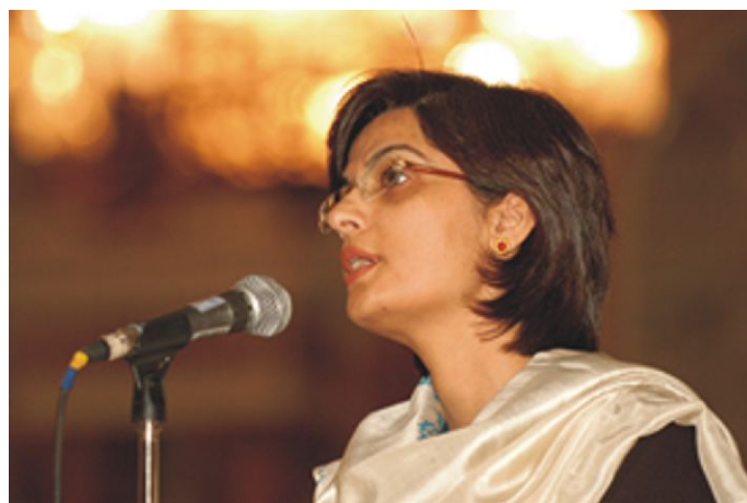
Dr Sania Nishtar, Alliance HPSR Board member, Founder and President Heartfile, Islamabad, Pakistan

The November edition of RealHealthNews carries an interview with Sania Nishtar, excerpts of which are re-printed below.