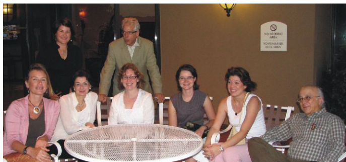
Participants, Miami Meeting, September 2008

Earlier this year the Alliance HPSR awarded start up grants to four teams in middle-income countries to further develop their proposals regarding innovative strategies to enhance policy maker capacity to use evidence. The four teams, from Argentina, Colombia, Georgia and Mexico met in Miami in September to discuss and refine their emerging proposals, and work together on developing an evaluation plan.