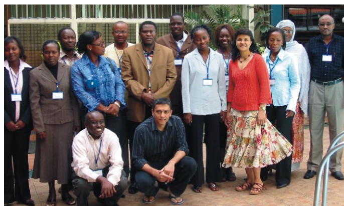
Workshop participants, Nairobi, May 2008

At the time of the workshop, data collection has been completed in the three west African countries but was still under-way in the three east African countries and in Zambia. The final study reports will be available towards the end of 2008. The report from the Chilean study group, which involved Bolivia, Chile and Peru is already available and can be accessed on the Alliance website. ■