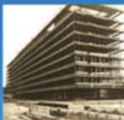
Exterior view of construction skeleton without windows