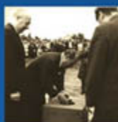
Director General Candau places canister in cornerstone

At the cornerstone ceremony a document recording important dates and decisions in the history of the building was placed in a canister along with the WHO Constitution and a list of the then 115 Member States and Associate Members