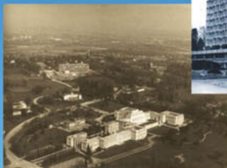
Aerial view of building under construction