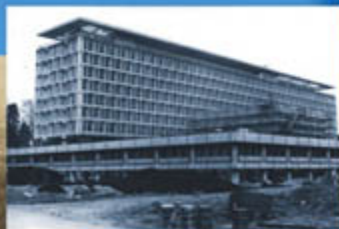
Construction of Executive Board room