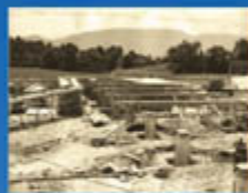
View of foundation showing pillars