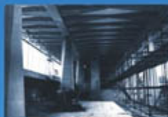
View of Interior

Main structure completed: 22 pillars representing Swiss cantons support 1750 tons including 16'000 square metres of glass and aluminium