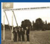
Banner in front of the future entrance to WHO Main Building