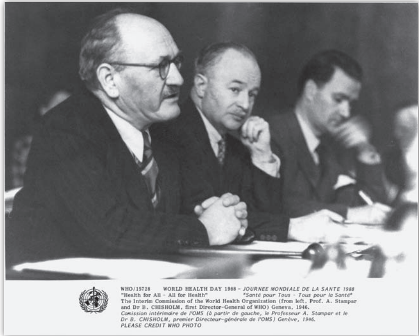
The Interim Commission met in Geneva in 1946. From left are Professor A Stampar, a consultant to the commission and Dr Brock Chisholm, first Director-General of WHO.

However, this did not impede the monitoring and coverage of impor-