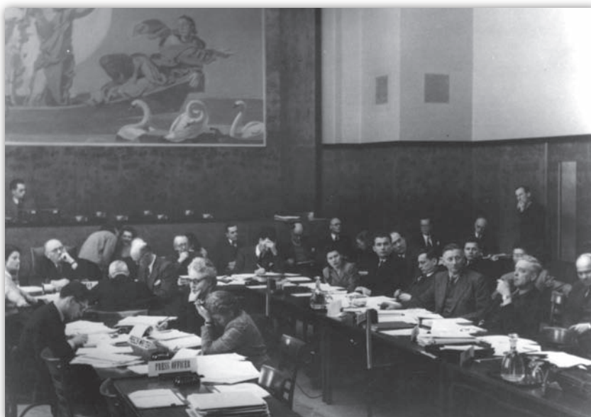
The Interim Commission, which was charged with establishing the United Nations health agency that eventually became WHO, discussed the possibility of publishing a journal to promote its work several times at meetings from 1946 to 1948.