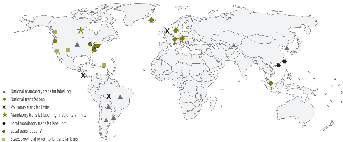
Fig. 1. Trans fat policies around the world, 2005–2012

a Trans fat labelling was mandatory locally in Hong Kong Special Administrative Region and Taiwan, China.