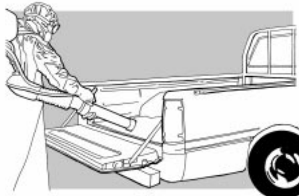
Fig. 58. Disinfecting the vehicle after transporting the body