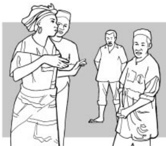
Fig. 59. Meeting with community leaders