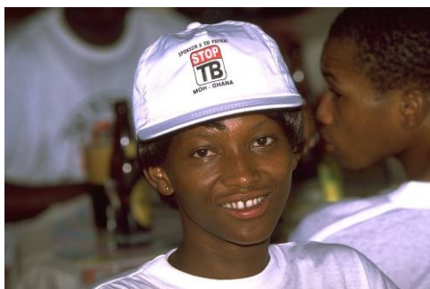
A TB patient at World TB Day celebrations in Ghana (2004).