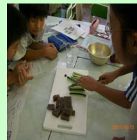
Teaching cross contamination in Schools in Japan. The National Institute of Public Health, Japan adapted the Five Keys to Safer Food Manual to elementary schools children.

The project was developed to teach Food Safety in urban and rural elementary schools. The materials were endorsed by the Ministry of Education. It is expected that including these tools in the national school curricula will contribute to a reduction in malnutrition and morbidity and mortality rates caused by water and foodborne diseases, especially in children.