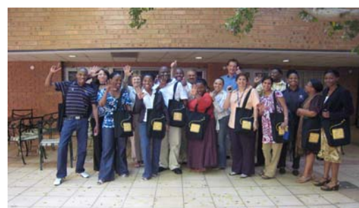
First pilot session of the Train the Trainer programme targeted to Women, Pretoria, South Africa. The Department of Health, South Africa, will use the programme to train food handlers in preparation of the 2010 Fifa World Cup