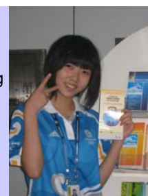
Promotion of the guide for travellers at Beijing airport

China: On the occasion of the Olympic Games, WHO and the Ministry of Health, PR China, released a specific adaptation of the WHO Guide on Safe Food for Travellers. The Guide was endorsed by The Beijing Organizing Committee for the Olympic Games (BOCOG) and was distributed in strategic locations such as Beijing airport, Olympic venues, hotels, restaurants and tourist destinations.