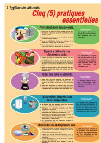
Examples of adaptation of the Five Keys poster Palau and Mali