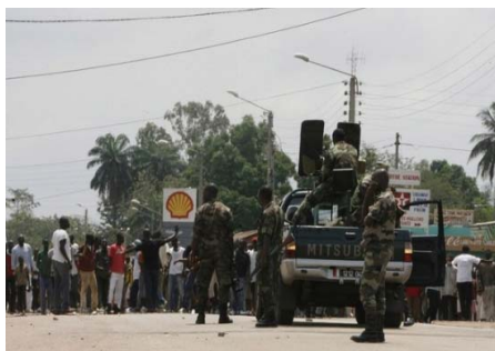
Cote d'Ivoire: demonstrators contained by the Security Forces, Toumodi