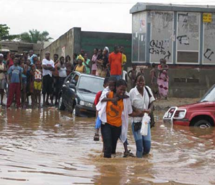
Floods in Angola, a look back