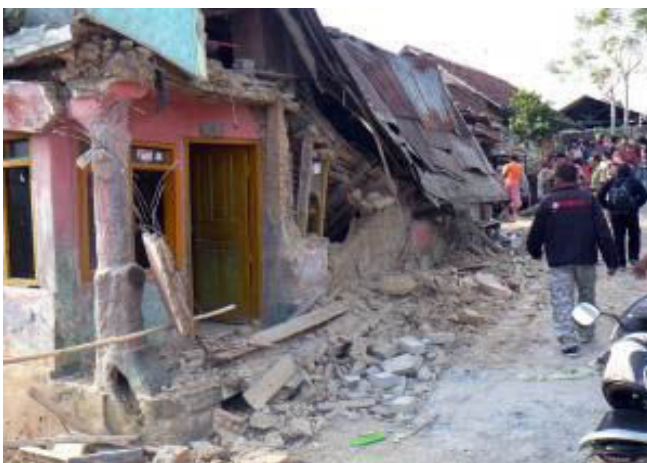
Damaged house in Tasikmalaya hit by 7.3 SR of Earthquake on 2 September 2009