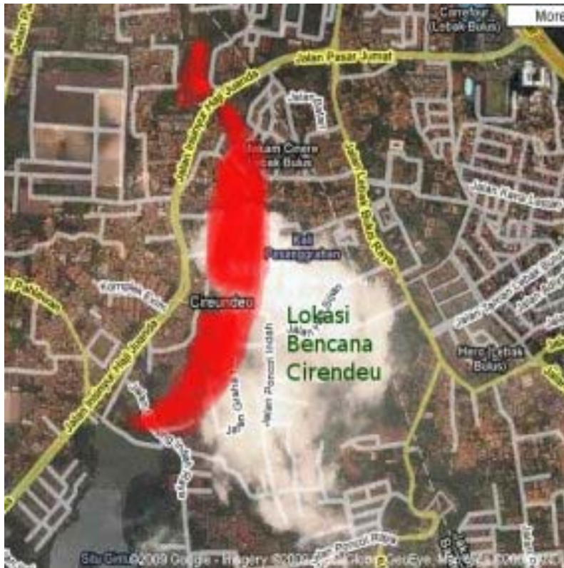
Caption: Disaster incidence site