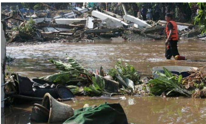
Caption: Rescue workers searching for victims