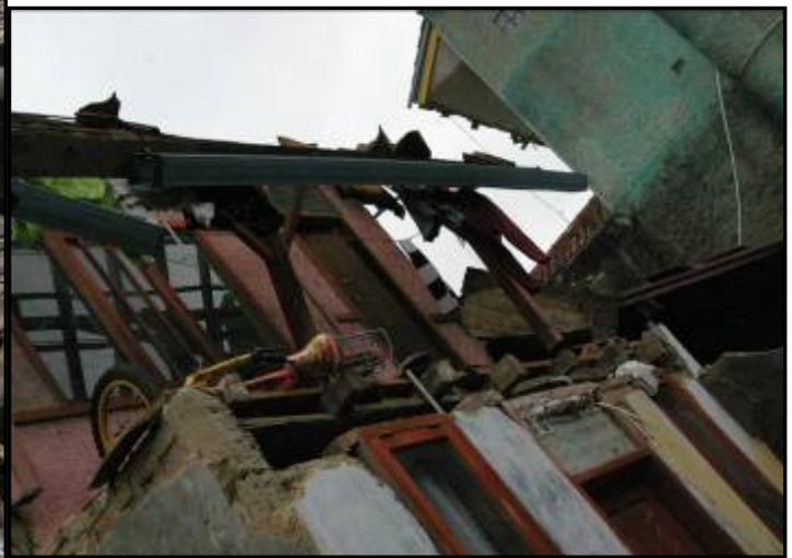
Caption: Some damage houses belongs to local residents in Pangalengan sub-district