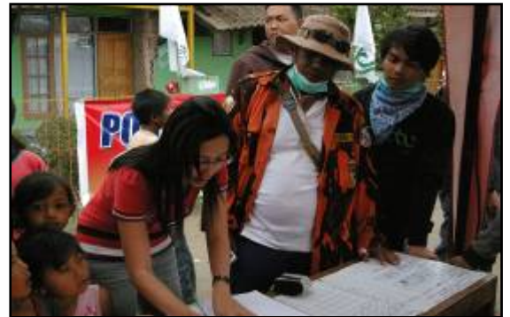
Caption: EHA-WHO staff monitors the number of casualties and damage house and infrastructure