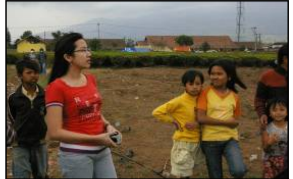
Caption: EHA-WHO staff assessing the need of children In IDP camps