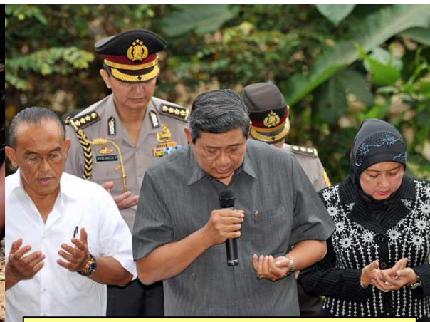
President of the Republic of Indonesia, Susilo Bambang Yudhoyono prays for the victims in Cianjur