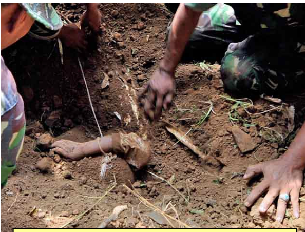
Victim of Landslide in Cianjur caused by the Earthquake Tasikmalaya, West Java