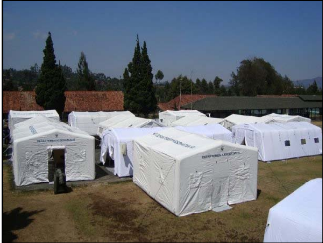
Caption: MOH Field Hospital in Pengalengan, Bandung District