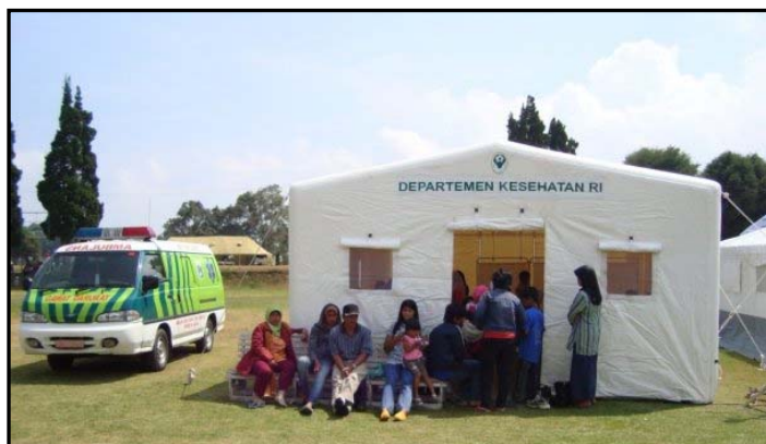
Caption: Crisis Center – MOH staffs delivering medical service through the field hospital in Pangalengan sub-district.