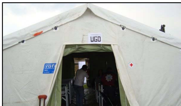
Caption: Emergency Unit, MOH Field Hospital in Pengalengan, Bandung District, West Java Province