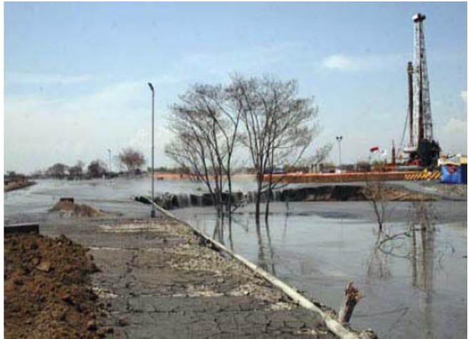
The blast made the land surrounding the relief well collapse

A gas pipe buried under the relief well exploded Wednesday, 22 November 2006. The explosion occurred at around 8:20 p.m. (1330 GMT) in part of the state-owned Pertamina East Java Gas Pipeline.