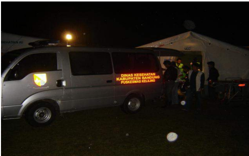
Caption: Patient referred to Field Hospital, Pangalengan, Bandung District. West Java Province