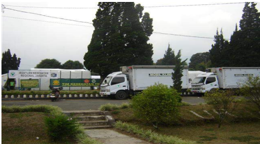
Caption: 2 light trucks serving as mobile clinics, in Pangalengan. Bandung District. West Java Province