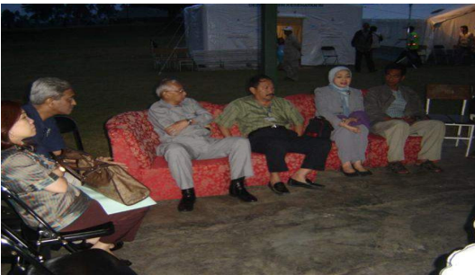
Caption: Coordination meeting with Crisis Center – MOH, PHO, DHO and WHO Assessment Teams at the field hospital in Pancaalengan sub-district.