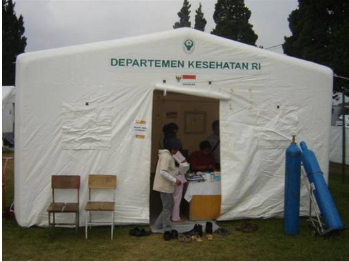
Caption: OPD, Field Hospital in Pangalengan, Bandung District