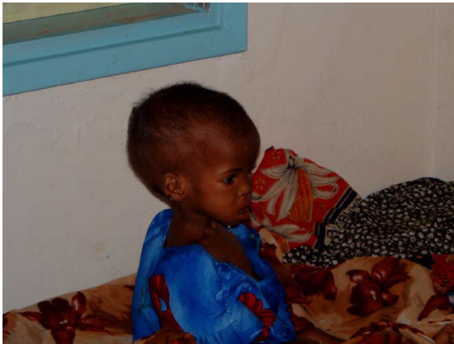
TFC at the Provincial Hospital