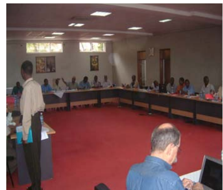
Meeting with Districts public health Officers in Garissa for North -eastern Province health situation analysis