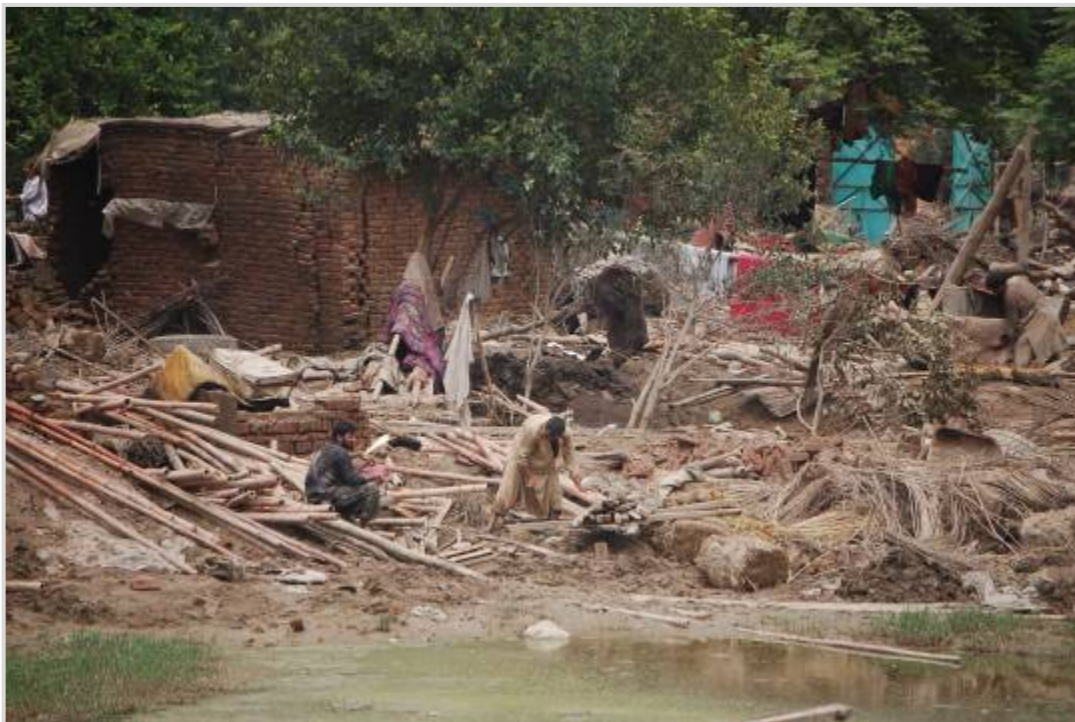
The floods have made life miserable for millions of displaced people in KPK. Outbreaks of communicable diseases are a threat due to limited access to safe water, and unsanitary living conditions.