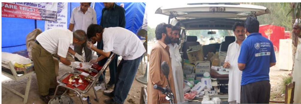
Mobile clinics operate 24-7 in many parts of Pakistan to respond to the health needs of affected population.