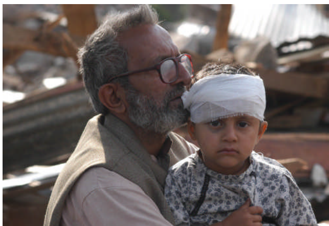
South Asian earthquake (2005)

Essential infrastructure such as communications, logistics, energy and water supplies, and emergency services and banking facilities need to be protected through multisectoral working to ensure the continuity of health services.