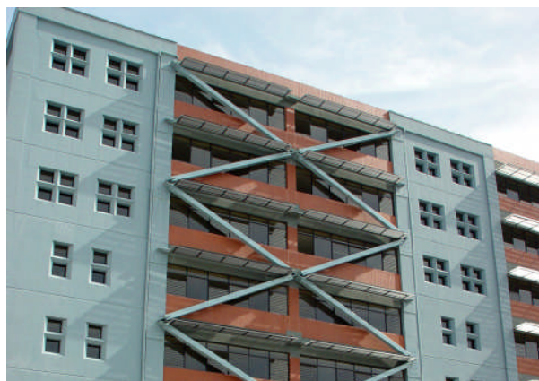
Structurally reinforced hospital, Ecuador

Emergency preparedness, including response planning, training, pre-positioning of health supplies, development of surge capacity, and exercises for health care professionals and other emergency service personnel, is critical for the effective performance of the health sector in the response.