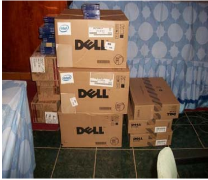
Each participating school benefitted from computers and UPS backups