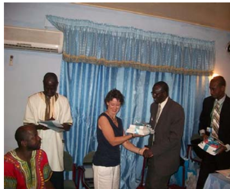
Proprietress of Timbooktoo Bookshop awarding donated core science books to School Principals