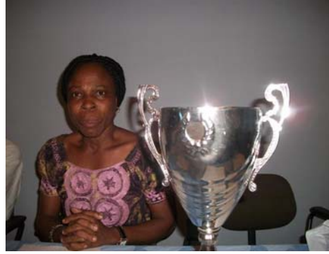
jubilant principal giving the vote of thanks at the end of the ceremony