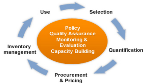
Procurement & Supply Management (PSM) Cycle

This Toolbox has been developed as a central repository for a wide range of health-related procurement & supply management tools. The Toolbox contains a search engine to facilitate quick tool selection. If a tool is available in the public domain a link to the respective website has been provided to download the most recent version.