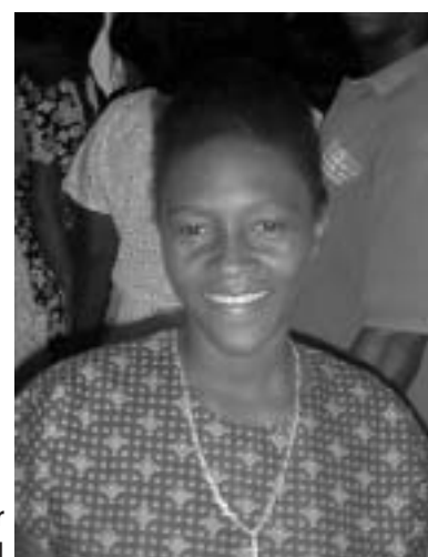
Fig. 2. Adeline after ARV therapy was initiated