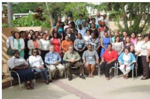
Participants of 30th Caribbean EPI Managers' Meeting 19-21 November 2014

Details: The format of the meeting involved technical updates on vaccine preventable diseases (VPDs) and immunization programme areas by PAHO EPI Advisors and other technical experts as well as sharing of country experiences in surveillance, research, vaccine introduction, ESAVI investigations, cold chain management etc. EPI managers also met in groups to facilitate discussions on achievements with their Plans of Action for 2014 and to finalize plans for 2015 with input from peers.