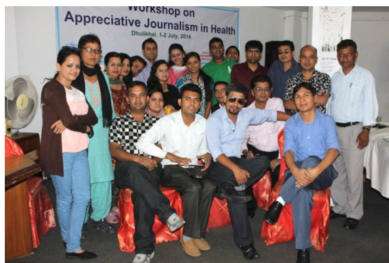
Participants at the workshop on appreciative Journalism in Health

The training has helped to develop and co-create an overarching vision of 'Health communication in Nepal'. It has also initiated the formation of a "Health Journalist Forum" involving journalists from various districts.