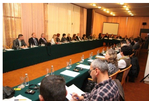
Participants at the platform

Details: Middle and high income countries in the European region have had a strong tradition of immunization for more than a century, and have successfully introduced some of the new vaccines. However, national immunization programmes today face numerous challenges, including the growing costs of existing vaccines, high costs of newer vaccines, supply availability and new market demands, especially as more countries move towards EU integration. Self-sufficient countries have started to face increasing difficulty in procuring the vaccines of their choice through local tenders.