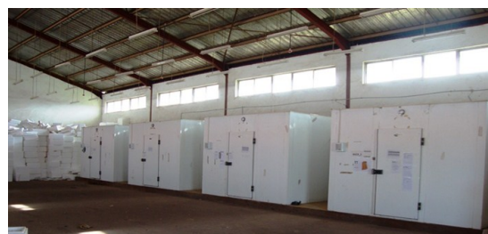
Walk In Cold Rooms at a zonal store.

In October 2014, an Effective Vaccine Management Assessment (EVMA) was conducted in Nigeria. Based on this assessment, Nigeria's supply chain performance has shown remarkable improvement. Since the last EVMA in 2010, significant actions at the central and zonal levels have been taken, with improvements in almost all criteria. To reduce the pressure on capacity at the central level, plans have included the proposed operationalization of hubs in Kano and Lagos, and the expansion of the National Strategic Cold Store.