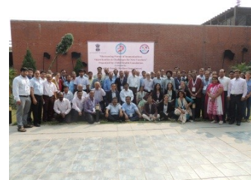
Participants from the New vaccines regional workshop

Participants: More than 60 participants and faculty that included private practice pediatricians, state immunization officials, and civil society representatives from Goa, Gujarat, Maharashtra, and Rajasthan. The workshop was endorsed by the Government of Gujarat and Academy of Pediatrics Gujarat and coordinated by Child Health Foundation, IVAC, and Global Health Strategies.