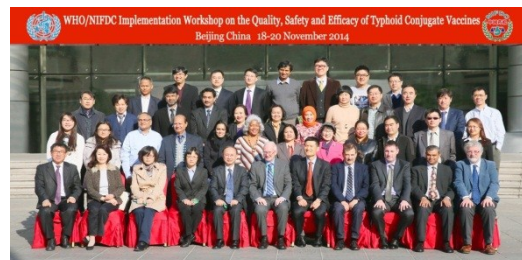
Participants at the WHO/NIFDC Implementation Workshop on the Quality, Safety and Efficacy of Typhoid Conjugate Vaccines, Beijing, China, 18-20 Nov 2014

Participants: Over forty participants comprising: a) representatives from the National Regulatory Authority and the National Control Laboratory (NRA/NCL) of Bangladesh, China (P.R.), Cuba, India, Indonesia, Japan, Korea (Rep.), Nepal, Philippines, Thailand and Viet Nam, b) vaccine developers and manufacturers including the US NIH and International Vaccine Institute, c) international experts from the National Institute for Biological Standards and Control (UK), Health Canada, and Post Graduate Institute of Medical Education and Research (India), and, d) staff from the World Health Organization and National Institutes of Food and Drug Control (NIFDC), China.