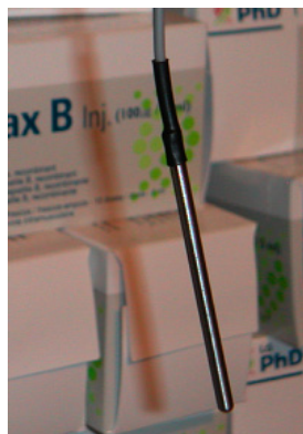
Figure 1: Gas-type temperature sensor

Several countries, among them Sudan and Iran, have found a way to automate the temperature monitoring system saving both time and money while increasing the accuracy and reliability of the monitoring system. While Sudan is a bit smaller in population than Iran, the two countries have a similarly sized number of surviving infants (1,086,000 in Sudan and 1,300,000 in Iran) and handled an almost identical number of doses of vaccines in 2007/2008 (about 108.8 million doses).