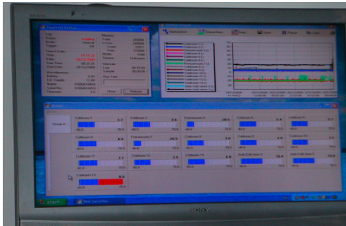
Figure 2: Monitor with temperature data