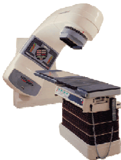
Figure 4.3 Cobalt-60 tele-therapy unit

Radiation Shielding The density of DU makes it a suitable material for the shielding of gamma radiation. For this reason, uranium has been used extensively in the medical, research and transport sectors (NUREG, 1999) as radiation beam collimators and containers to transport nuclear sources. Thus, DU has often been used as a shield for radioactive sources in tele-therapy units (figure 4.3) used in the treatment of cancer and in linear accelerators. Typical quantities of DU used in such equipment range from tens to hundreds of kilograms.