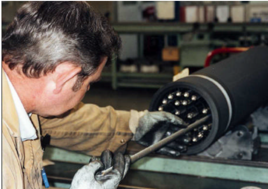
Figure 4.1 Nuclear fuel rods being loaded.

The first step in the process is mining; historically, this has involved subterranean or open-pit ore rock removal and now also involves liquid in-situ leaching of unconsolidated deposits (the latter method has been used extensively in the Czech Republic and the former East Germany). The next steps in the production of uranium fuel, aimed at concentrating the uranium, are usually carried out near the mine to save on transportation costs. Methods used depend on the nature of the ore, and may involve mechanical procedures such as crushing, screening and flotation, followed by acid or alkaline leaching, solvent extraction, or ion exchange and eventual precipitation. The product of these concentration steps contains perhaps 40%–70% uranium by weight and is generally shipped to a central processing plant to be further refined. This purification is either by digestion with nitric acid and extraction of the resulting uranyl nitrate into an organic solvent, or by conversion to UF_6 and fractional distillation of that volatile compound. At this stage, all naturally occurring radioactive progeny have been removed from the uranium which is considered to be chemically pure. However, due to the inherent radioactive nature of uranium, following this purification step the presence of other radioactive elements within the uranium decay chains will start to increase.