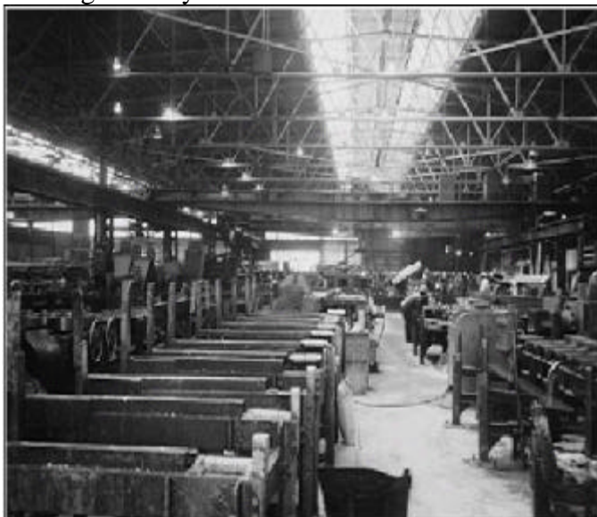
Figure 5.2 Workshop for the machining of uranium.

In the second case, there is the potential for contact with pure uranium or uranium compounds such as UF_6 which is extremely toxic due to the release of HF when in contact with water. To date at least one case of attempted acute poisoning (non-fatal) has been recorded in which the subject, a uranium processing worker, deliberately consumed processed uranium (Pavlakakis et al., 1996).