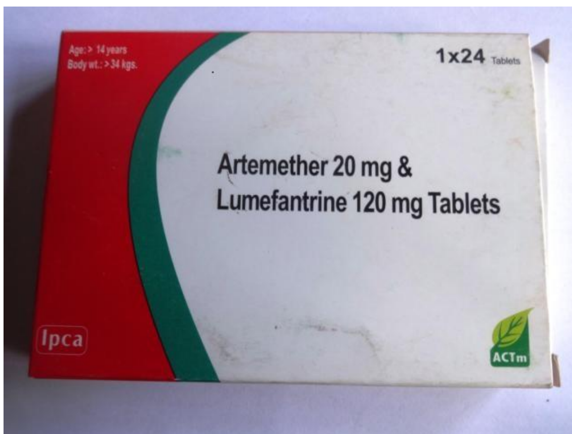
Fig. 1 Product discovered in Côte d'Ivoire, secondary packaging

For any further information concerning this alert please contact rapidalert@who.int .