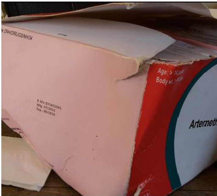
Fig. 5 Product discovered in Togo, secondary packaging