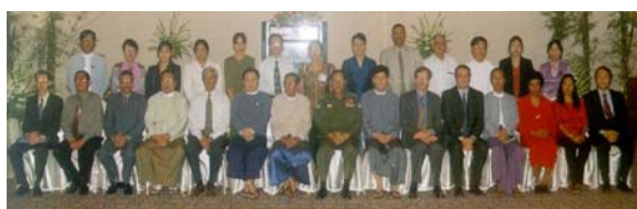
Participants in the intercountry meeting in Yangon, Myanmar

The anticipated outcome of the workshop was the finalisation of the protocol for the identification and management of generalised tonic-clonic seizures in the community.