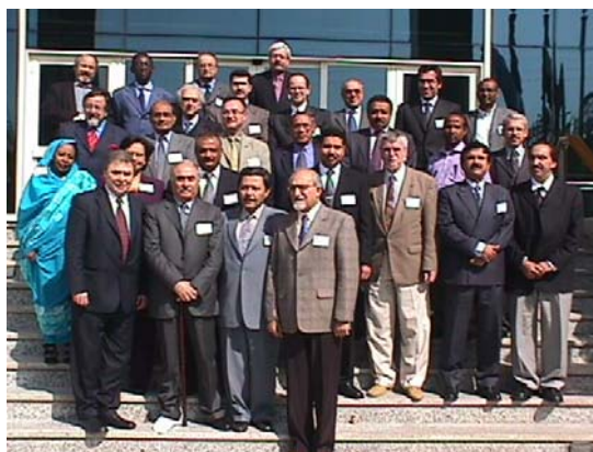
Participants in the Intercountry Meeting in Cairo

We call on the governments of the member states of the Eastern Mediterranean Region, national and regional, public and private organisations, all health care providers, and the general public to join us in taking strong and decisive action to meet the objectives of the Global Campaign Against Epilepsy of the WHO/ILAE/IBE “Epilepsy: Out of the Shadows”.