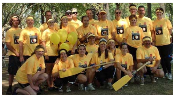
The participants in the Dragon Boat Race wearing Campaign t-shirts

The event was covered by the local press, with more to come in a number of hospital magazines, the Department of Human Services etc.