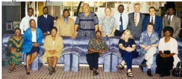
Participants at Consultative Meeting on Epilepsy in Africa in Harare, October 2002

Two consultative meetings on the implementation of the Global Campaign Against Epilepsy in the African Region in Harare, Zimbabwe (June 2001/March 2002) with the participation of representatives from Cameroon, Ethiopia, Kenya, Lesotho, Mozambique, Senegal, South Africa, Swaziland, Tanzania, Togo, Uganda and Zimbabwe and in Lomé, Togo in March 2002 with the participation of Algeria, Benin, Burundi, Burkina Faso, Cape Verde, Chad, Congo, Democratic Republic of Congo, Côte d'Ivoire, Gabon, Guinea/Conakry, Mali, Mauritania, Niger, Rwanda, Senegal and Togo.