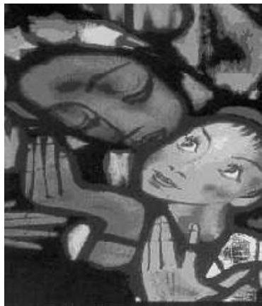
A poster produced by the Philippine League against Epilepsy to advertise the "Walking Out of the Shadow of Epilepsy" Walkathon

The weeklong celebration culminated in a series of "walkathons", with the participation of people with epilepsy and their carers, medical students and representatives of the pharmaceutical industry.