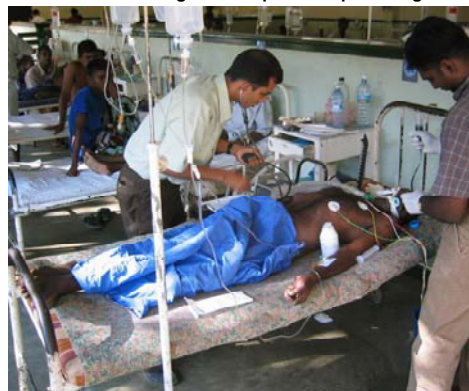
Clinical management of pesticide poisoning