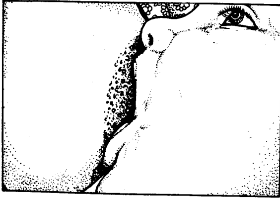
Fig.1 a. A baby well attached to his mother's breast (Fig.19 in Participants' Manual)