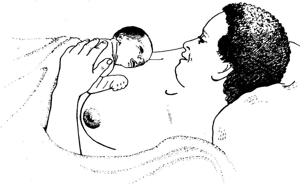
Fig.2 Skin-to-skin contact in the first hour after delivery helps breastfeeding and bonding (Fig.20 in Participants' Manual)

Ask participants if they have any questions, and try to answer them.