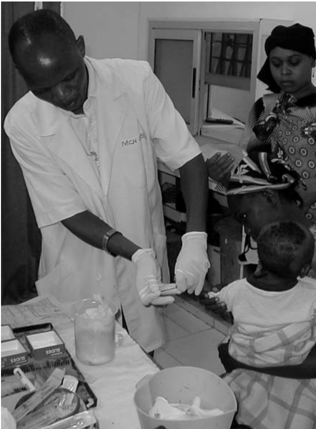
Lab worker giving an injection to a child in Muhimbili National Hospital in Dar es Salaam, Tanzania.

HIV or HCV positive can be delayed up to nine months following infection, so a negative test does not necessarily mean that the individual is not infected. In addition, medical treatment of emergency patients and provision of first aid do not provide any opportunity for testing prior to treatment.