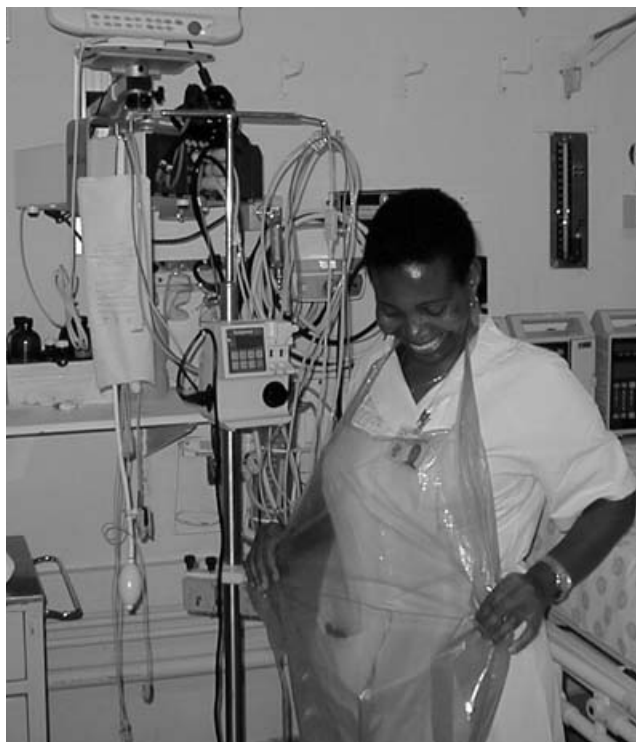
Worker in Pretoria Academic Hospital in South Africa dons protective apron.

ples include Universal Precautions (see below), allocation of resources demonstrating a commitment to HCW safety, a needlestick prevention committee, an exposure control plan, and consistent training.