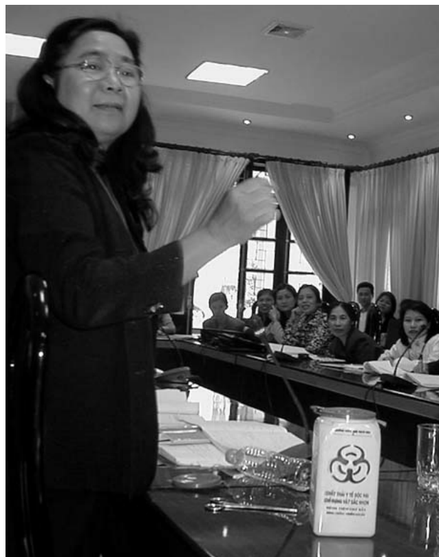
President of the Hanoi district nurses association demonstrating a sharps container to the project leaders at the National Institute for Occupational and Environmental Health in Vietnam.

In September 2003, the WHO and the International Council of Nurses began a pilot project in three coun-