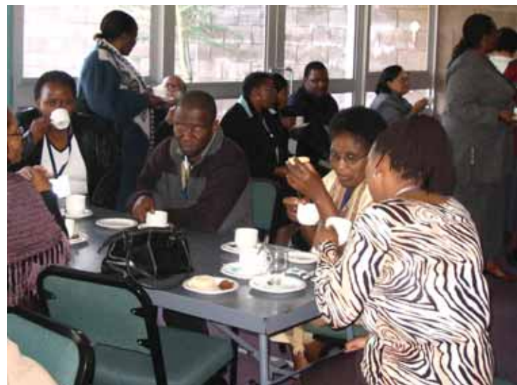
Delegates have a tea break

It was necessary to undertake in-service training for all stakeholders to ensure a common understanding of the diagnostic features and treatment regimes of different epileptic syndromes. Furthermore, all staff received in-service training regarding the diagnosis and management of epilepsy and best practice guidelines.