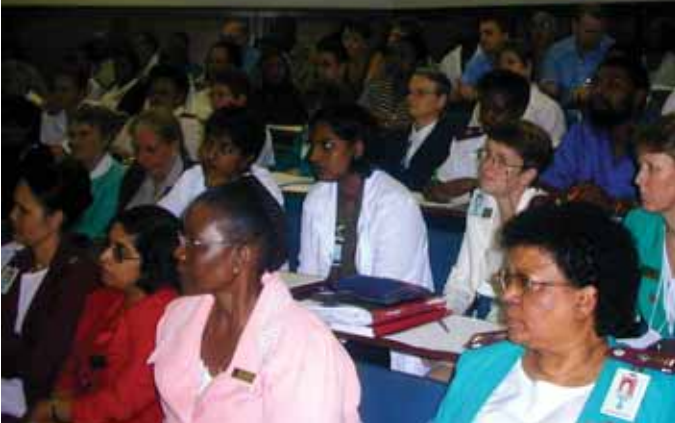
Representatives of Addington Hospital crowded into the auditorium in 2002 to hear what they were letting themselves in for the second time around.

ADDINGTON HOSPITAL IN Durban, KwaZulu-Natal, has been accredited by COHSASA for a second time.