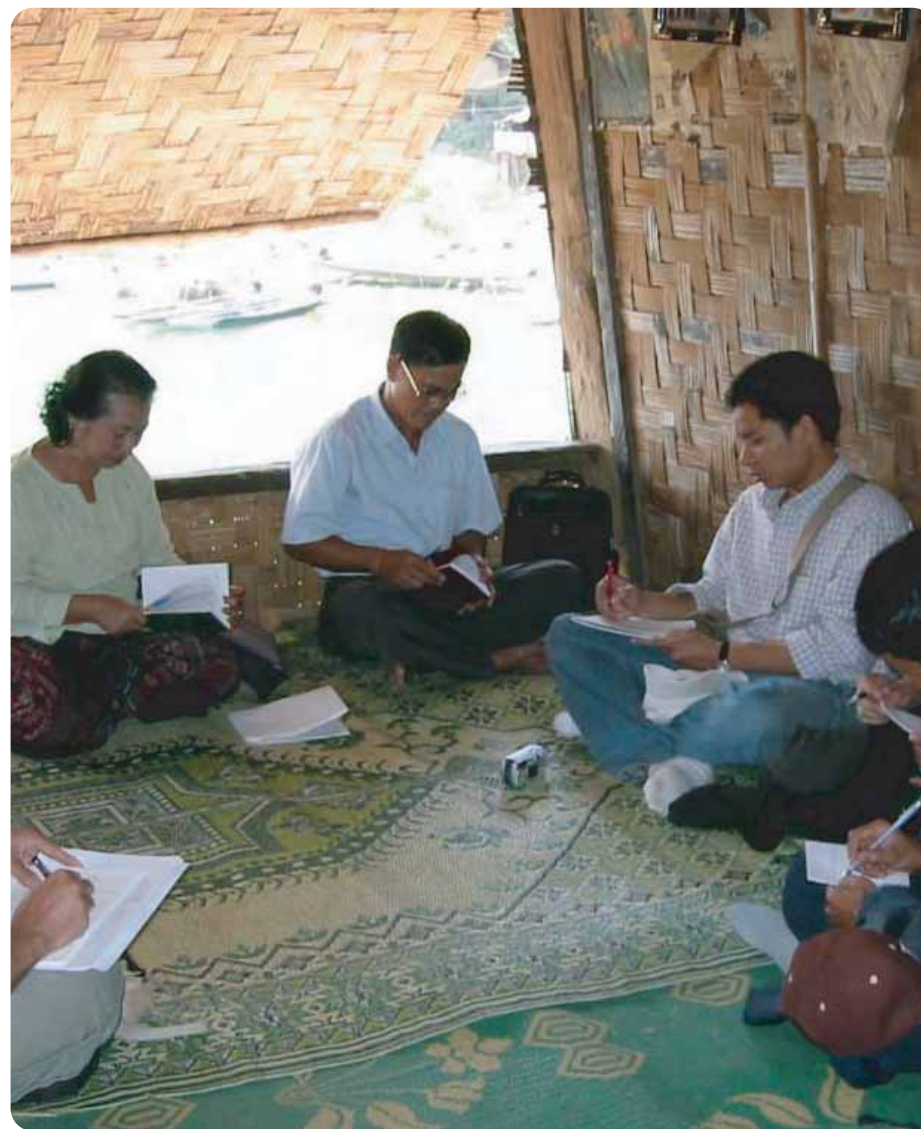
Mid-level managers from health, environment, development, and planning sectors interview a fishing village resident in Lao PDR about the impacts of a nearby dam constructed three decades ago. Their findings will contribute to an impact assessment of new dams, now in the early planning stages. This health impact assessment exercise was part of a course conducted in 2003 by the WHO/FAO/UNEP Panel of Experts on Environmental Management for Vector Control (PEEM), in collaboration with the Danish Bilharziasis Laboratory and the Liverpool School of Tropical Medicine.

As a bridge between science and policy-making, the assessment of linked health and environmental impacts can play a significant role in expanding the narrow focus and frequent shortcomings of sectoral assessment. It also ensures that the direct contributions of ecosystems to better health are duly captured in the decision-making process.