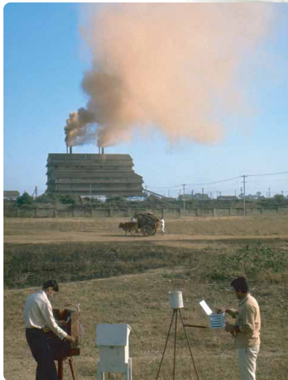
Measuring air pollution (above); testing water quality (background).

Such resources also make reference to the broader range of evidence and assessment tools that WHO/UNEP have developed and are refining constantly. These include: environment and health monitoring frameworks, providing the data upon which evidence of problems and potential solutions may be based; environment and health standards and multilateral environmental agreements, which set baselines and goals to be achieved; tools for comparative risk assessment/burden of disease assessment for quantifying environmental hazards in terms of their impact on human life and health; case-study experiences describing good-practice interventions; environment and health indicators that track progress to the goal; and tools for impact assessment.