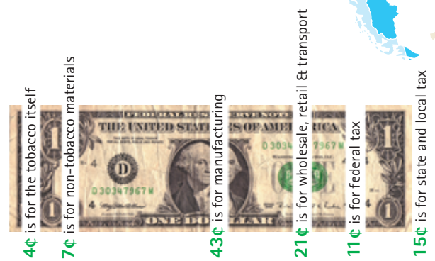
Where the tobacco dollar goes For every dollar spent on tobacco in the USA...

Because of the use of additives and other technologies, such as "fluffing" and the use of reconstituted tobacco, tobacco companies use less and less tobacco per cigarette.