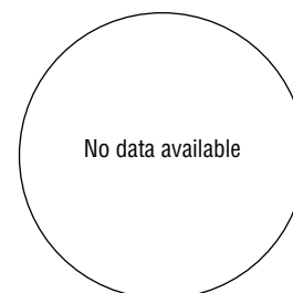
Market Share by Cigarette Manufacturer