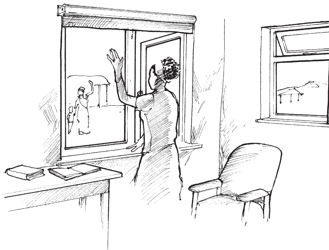
Figure 7.1 House with good ventilation and light