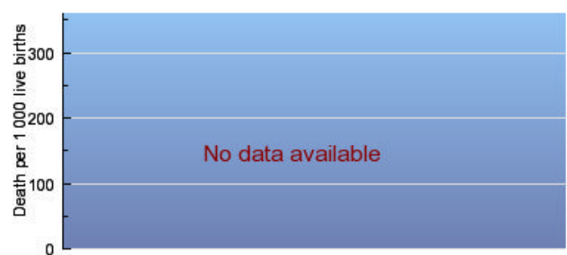
Under-5 mortality rates by wealth quintile China, DHS

Note: rate for 10-year period preceding the survey