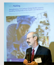
Photo gallery of the Summit: Strengthening 21 st Century Global Health Systems: Investing Strategically in the Health Care Workforce

Photo gallery of the HSA Post Graduate course