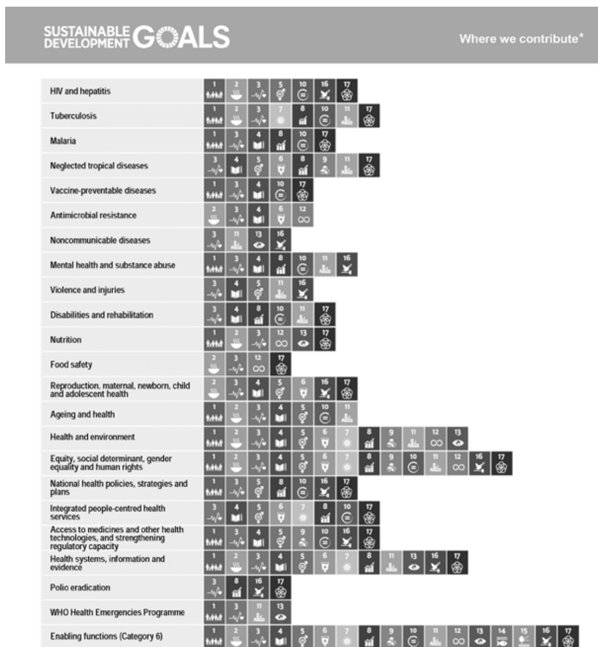
Figure 1. Sustainable Developments Goals and the WHO programme areas that contribute to them.

*This is based on an assessment made by WHO programme area networks, identifying the different Sustainable Development Goals to which their work contributes. Information regarding the Sustainable Development Goal targets to which WHO's work contributes is provided in the programme budget webportal ( http://extranet.who.int/programmebudget/ )