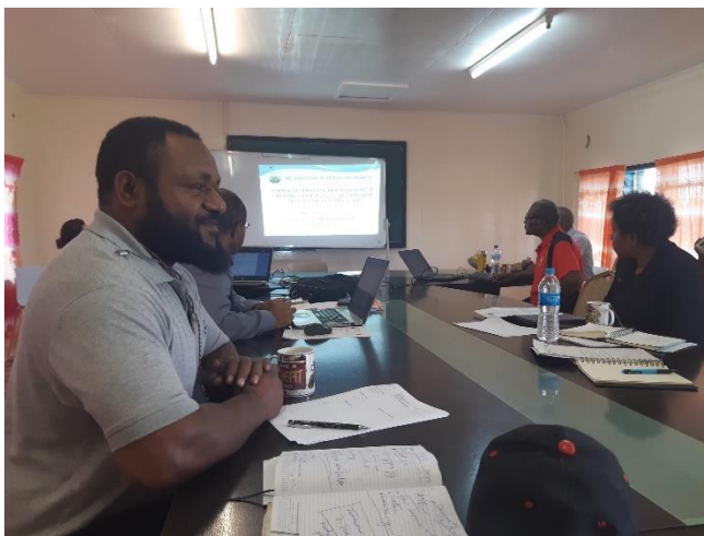
Hela PEOC activated and conducts planning and preparedness activities

WHO Website: https://www.who.int/emergencies/diseases/novel-coronavirus-2019/