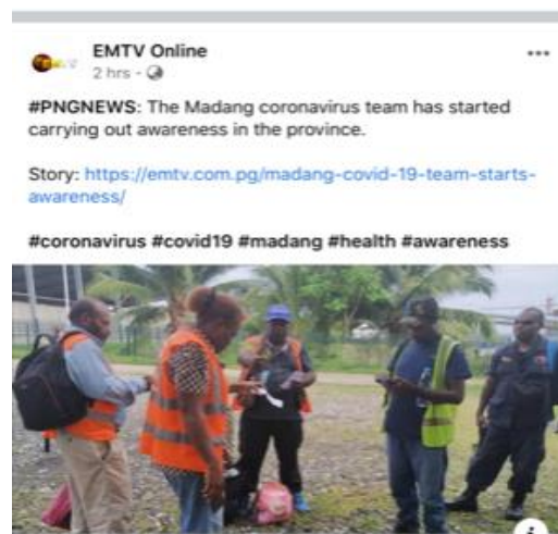
Madang awareness messages