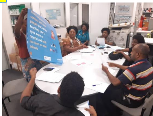
Planning for awareness campaign in schools